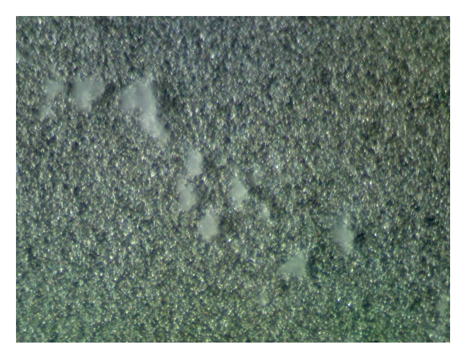
Figure 4. Photograph of the resonator surface with bulk lauric acid.

crystallization is difficult. The in-line monitoring of the fatty acid crystallization using the quartz crystal resonator is relatively simple and efficient to observe the process.