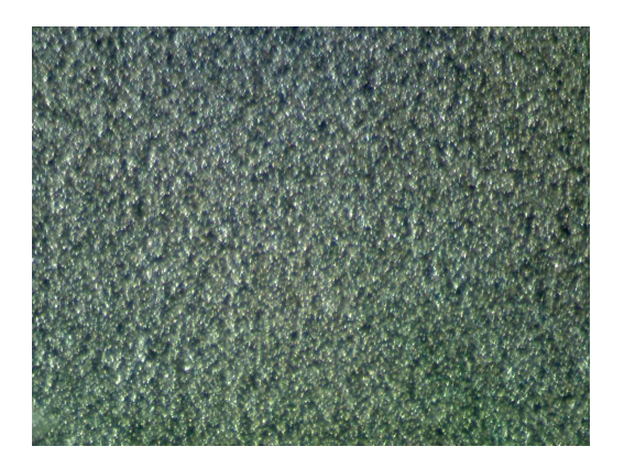
Figure 3. Photograph of the resonator surface coated with oily lauric acid.

below 37 °C, the frequency drops in a slope until the temperature reaches around 33 °C. Then another decrease begins in a slightly less slope. The frequency is obtained after the deduction of a blank test result, and therefore the effect of temperature variation is eliminated. The first decrease of the frequency indicates the oily nucleation of the lauric acid, which is observed in Figure 3. The photograph of the microscopic observation shows the surface of the quartz crystal resonator covered with oily lauric acid. When the temperature drops further, the bulk lauric acid formulates on the resonator surface as demonstrated in Figure 4.